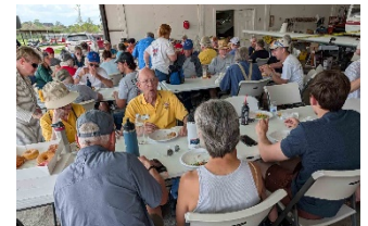
A darn large crowd!