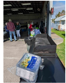
Getting things lines up & ready!

The event is participated by all 4 clubs with a different sponsoring club yearly. It is an informal gathering of enthusiasts to drive their cars, park them, have lunch together and socialize in a picturesque setting. There were 95+ cars pre-registered and from sight it appears the vast majority were there.